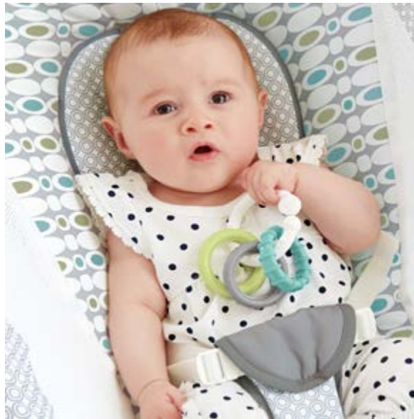
Above: Figure 3