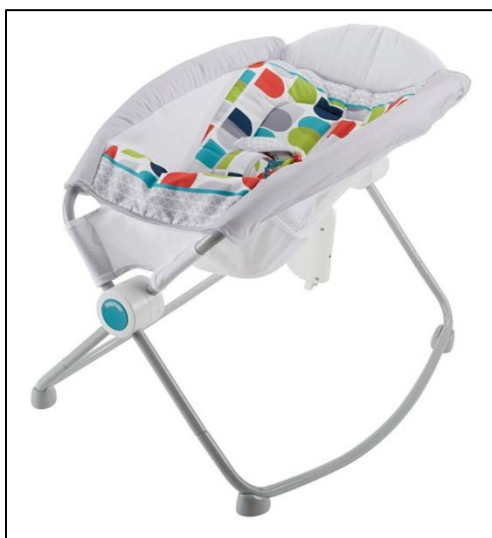
Above: Figure 1

32. A critical common design element of the Rock 'n Play Sleeper is a collapsible frame that supports a fabric hammock with tall sides (Figure 1), forcing the infant into a reclined position, with the head elevated at an approximately 30-degree angle from the lowest part of the baby's torso (Figure 2) and restraints (Figure 3) that, if used as Defendants recommend, limit the baby's motion at the hips and waist. There is a hard plastic shell inside the hammock that is covered with soft padded material (Figures 4 and 5), upon which the baby is placed. Different views of the product are shown below: