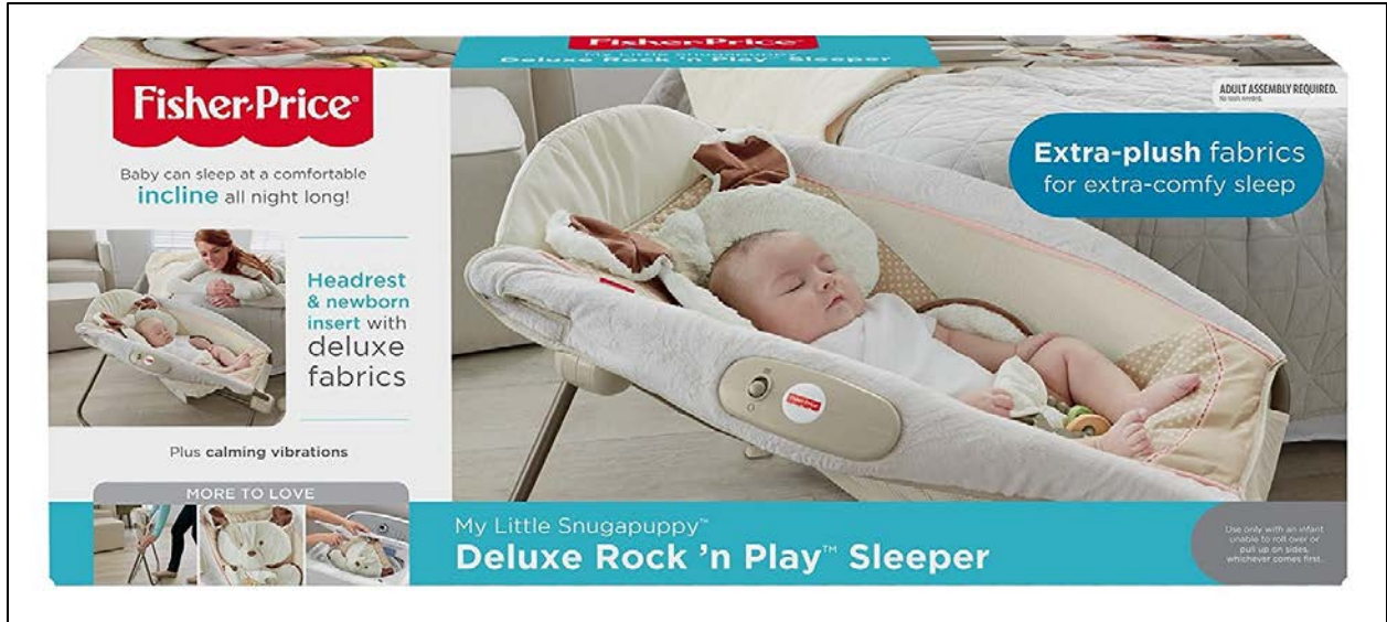
Above: Figure 6