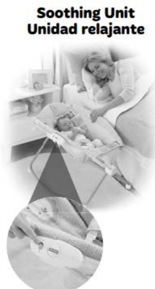
Above: Figure 11

130. This image is misleading because it implies that mothers can sleep when their babies are in the sleepers, while, at the same time, Defendants warn that babies should be supervised when in a Rock 'n Play Sleeper. Mothers cannot supervise their children when they are themselves sleeping.