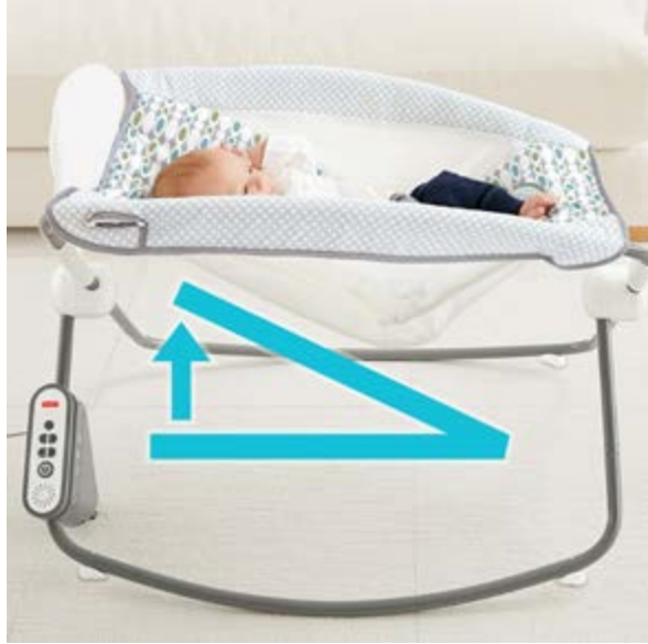
Above: Figure 2