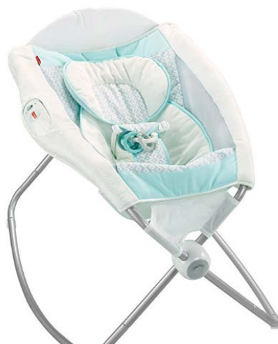
Above: Figure 5

33. Some “Premium” and “Deluxe” models, such as the deluxe model immediately above, have additional padding around the head.