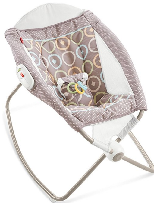
Above: Figure 4