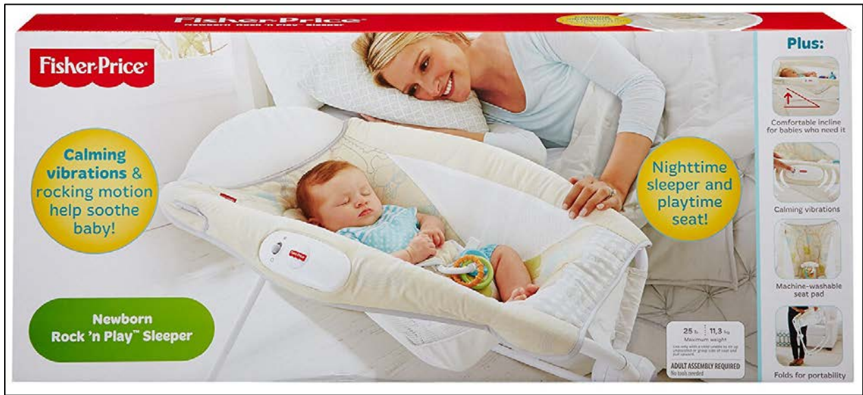
Above: Figure 7